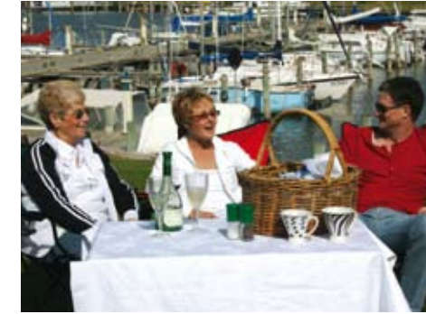
Easter picnickers enjoy the fine weather.

Hundreds of people took advantage of the fantastic weather over the Easter break, enjoying both on and off water activities. The Lower Murray was alive with families making the most of the warm temperatures with the younger ones tubing and jet skiing and the young at heart plying the calm waters until well into the evening. But the long weekend was not only about boating; the newly refurbished lower deck at Rankine's Landing Tavern was brimming with patrons while others opted to enjoy a traditional picnic on the lawns. Fine weather is expected to last, providing everyone with a final opportunity to visit, play and stay at TMHI before winter sets in. For information about booking your 'last chance' holiday contact The Marina Office on 8555 7300.