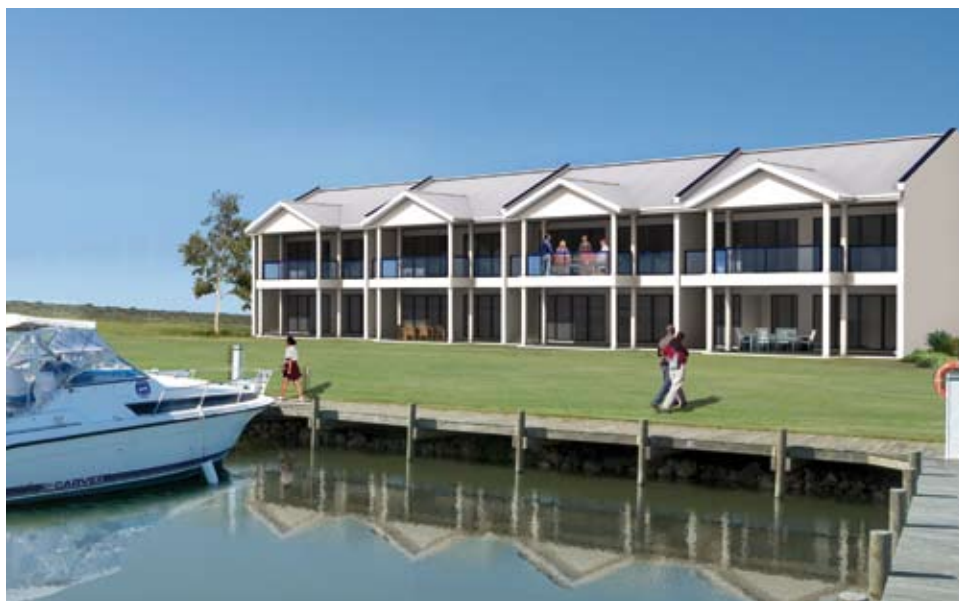
Artist's impression of The Sunrise Terraces.

Currently under construction by local award-winning builder Bailey Homes, The Sunrise Terraces feature spectacular, uninterrupted views across The Marina Basin, towards the soon to be built yacht club.