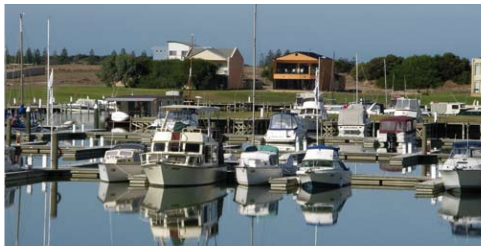
The floating jetties at TMHI.

The demand for safe, deep moorings - like the ones found at TMHI has increased as the water levels have decreased. As a result the original dates set for the construction of a fourth floating jetty have been brought forward. It is anticipated that the new floating jetty will be completed in time for the 2008 boating season.