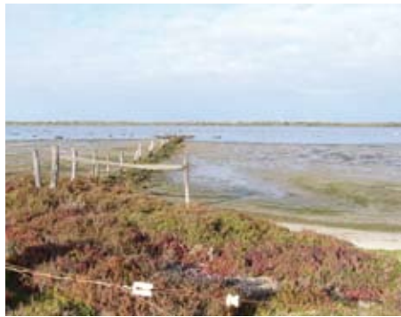
An old fence line located on Hindmarsh Island.

The low water levels provide us with the opportunity to see some of the historical artefacts that usually lie below the surface of our 'Mighty River'. Most of these features date back to before the establishment of the Goolwa and Coorong Barrages and are a reminder of the region's farming history. The abundance of old jetties and more commonly old fences, which were pivotal in the control of stock at low tide, can be seen along the shore line in the Finnis River, around Currency Creek as well as along the eastern side of Hindmarsh Island. More of the region's farming history can be appreciated on Mundoo Island, where Sally and Colin Grundy still muster cattle from island to island on horse back. Mundoo Island tours are available by arrangement. For more information contact The Marina Office on 8555 7300 or visit www.tmhi.com.au/holidays/tours.html