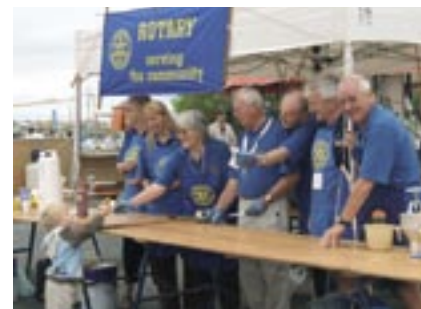
Above: Goolwa Rotary, serving something up for everyone.

Exhibitors, sponsors and patrons all expressed their support for next year's event.