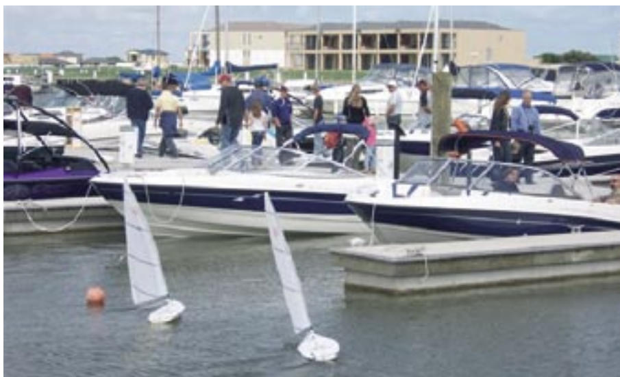
Above: Boats big and small, including some remote controlled yachts.

The Boating Extravaganza at The Marina Hindmarsh Island delivered "Serious Boating Fun for the whole family" as over nine thousand people flocked to Hindmarsh Island to be part of the weekend's festivities.