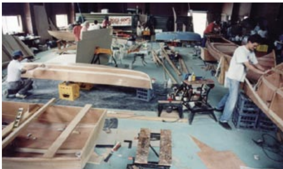
Above: Boat building classes in progress.

Duck Flat Wooden Boats will be kicking off a series of boatbuilding classes through the year with the first to be held at The Marina Hindmarsh Island 4th-14th October.